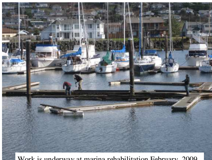
Work is underway at marina rehabilitation February, 2009 above and below.